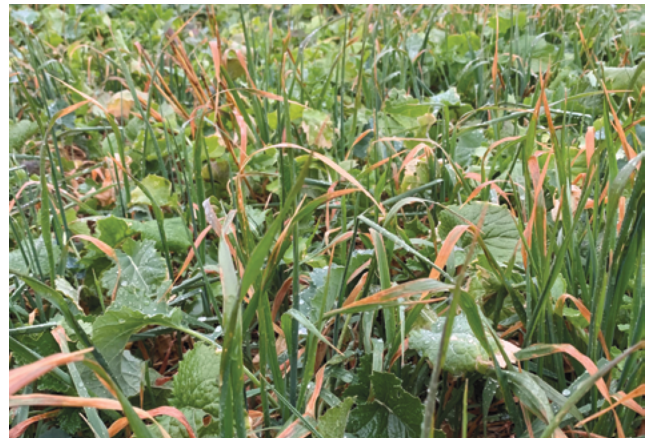
Cover crop East Central South Dakota

These values and rates are regional and should only be used as a guide and are not an indication of values for specific properties.